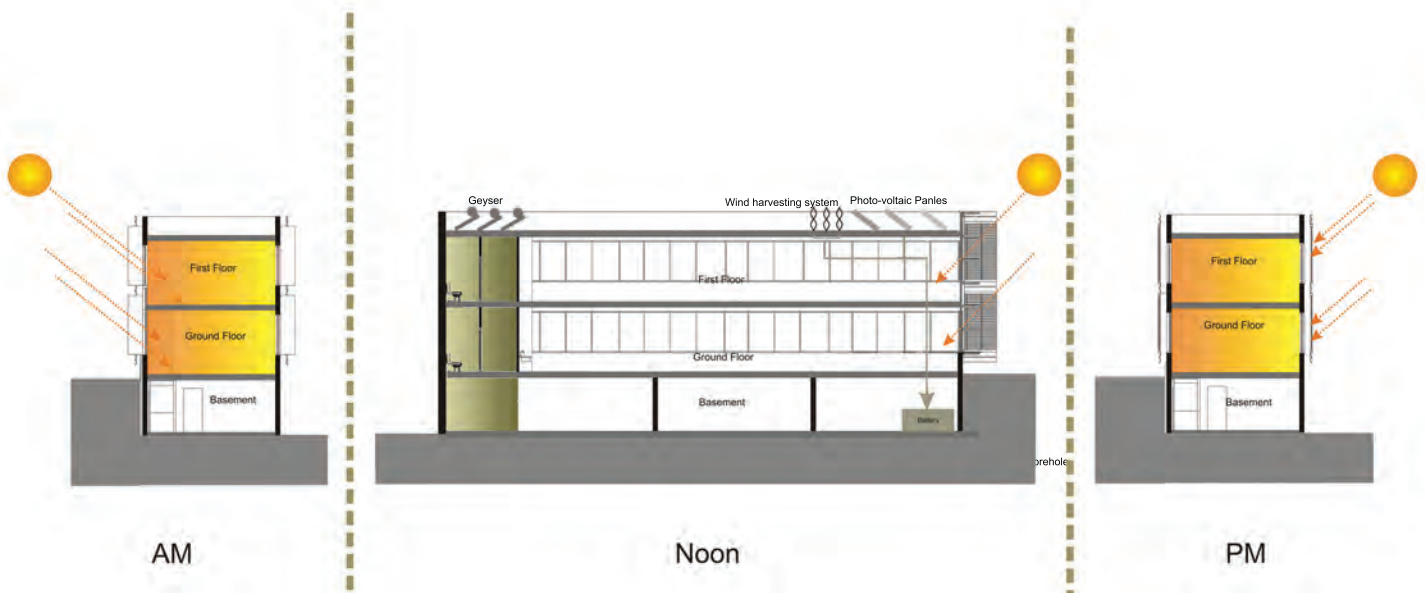
passive winter heating active solar power/active wind power